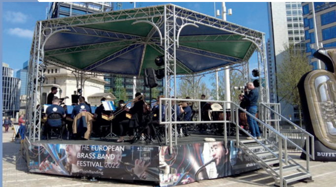
Brass Band Festival, Birmingham