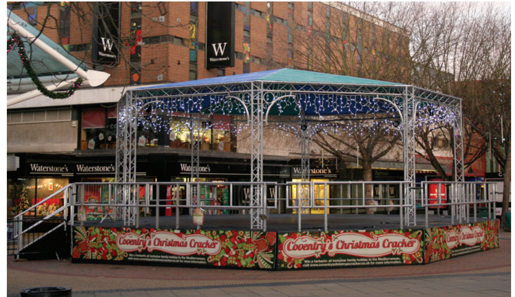
Christmas Festival Event, Coventry