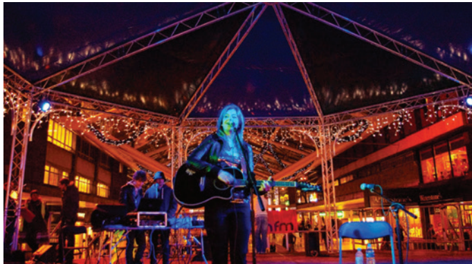
Music Performance on Bandstand